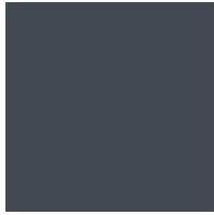
Polypropylene Mat anthracite grey