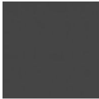
Painted metal Supreme anthracite