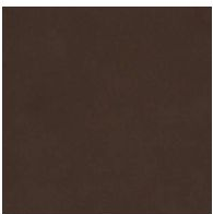
Painted metal Mat bronze