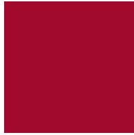
Polypropylene Mat red