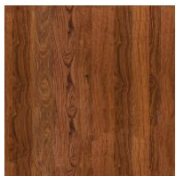
Solid wood American walnut