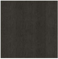
Solid wood Coal ash