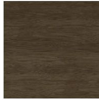
Solid wood Walnut painted ash