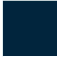
Polyethylene Mat blue navy