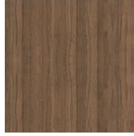
Solid wood Walnut Canaletto

Materials, fabrics, leathers, colors and finishes are approximate and may slightly differ from actual ones. You can find the complete collection of Bonaldo fabrics and leathers on the website