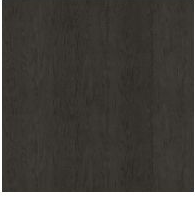
Solid wood Coal ash