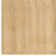
Solid wood Natural ash