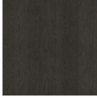
Veneered wood Coal ash