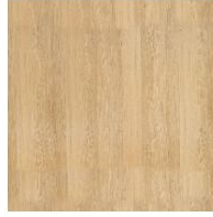
Veneered wood Natural ash

Materials, fabrics, leathers, colors and finishes are approximate and may slightly differ from actual ones. You can find the complete collection of Bonaldo fabrics and leathers on the website