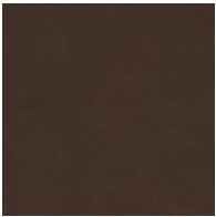
Painted metal Mat bronze