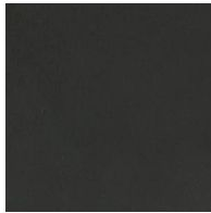
Painted metal Mat lead

Materials, fabrics, leathers, colors and finishes are approximate and may slightly differ from actual ones. You can find the complete collection of Bonaldo fabrics and leathers on the website