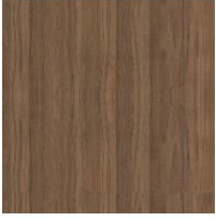
Veneered wood Walnut Canaletto