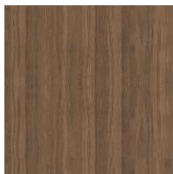
Veneered wood Walnut Canaletto

Materials, fabrics, leathers, colors and finishes are approximate and may slightly differ from actual ones. You can find the complete collection of Bonaldo fabrics and leathers on the website