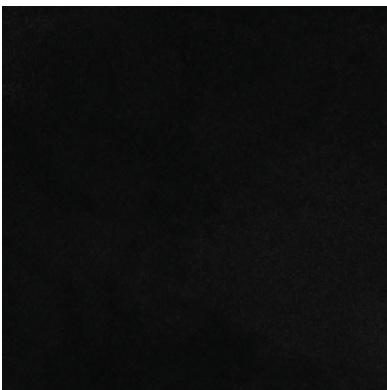
nero assoluto absolute black