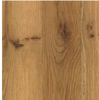
rovere "old" "old style" oak