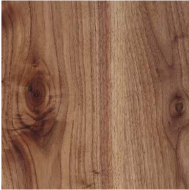
noce canaletto canaletto walnut