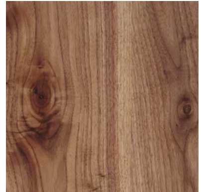
noce canaletto canaletto walnut