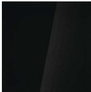
vetro extralight retroverniciato nero Black back-painted extralight glass