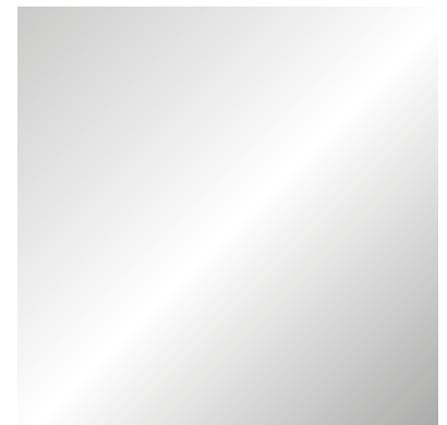
vetro extralight retroargentato back-silvered extralight glass