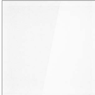
vetro extralight extralight glass